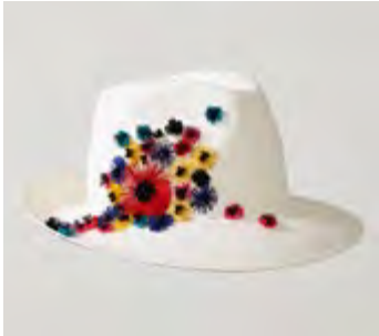
FELICITY SSLUX71729 Tall fedora in white panama, decorated with coral reef embroidery