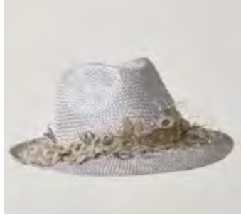
BAY SSLUX71731 Tall fedora in grey ramie straw, draped in French lace and veiling