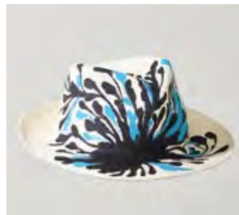
SSKDA617001-D Asymmetric fedora in off white panama hand painted as blue and black coral reef