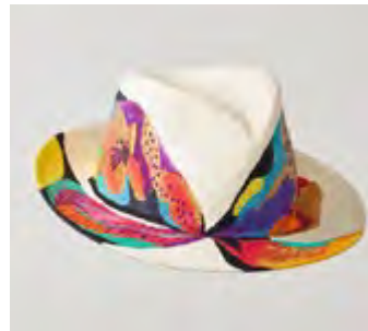
SSKDA617001-A Asymmetric fedora in off white panama hand painted with multi colour flowers