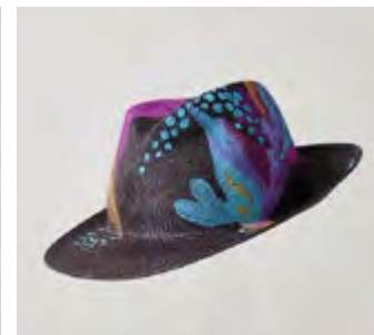
SSKDA617002-H Asymmetric fedora in black panama hand painted as a bird of paradise