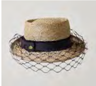
MARINA SSLUX71734 Boater in natural fishnet straw, wrapped with a frayed grosgrain ribbon and honeycomb veil