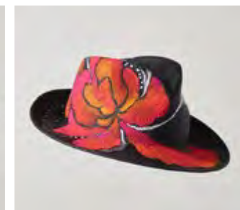
SSKDA617002-F Asymmetric fedora in black panama hand painted with orange tropical flower