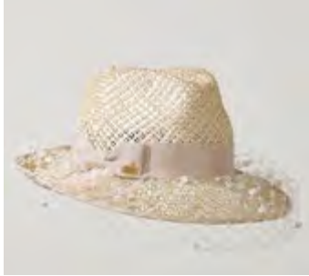
FRANCOISE SSLUX71730 Tall fedora in natural jute straw, with grosgrain ribbon and embellished with spotted veil