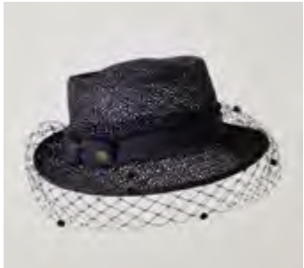
MARINA SSLUX71734 Boater in black fishnet straw, wrapped with a frayed grosgrain ribbon and spotted veil