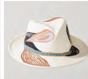
SSKDA617001-B Asymmetric fedora in off white panama hand painted with feather motif