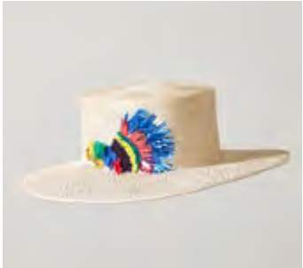
MISTY SSLUX71732 Wide brimmed boater in natural wicker sisal, with sequin applique of bird of paradise