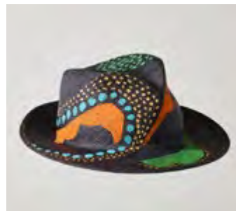
SSKDA617002-G Asymmetric fedora in black panama hand painted as under water world