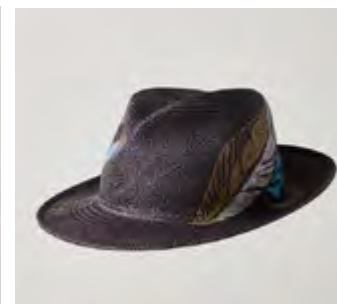
SSKDA617002-E Asymmetric fedora in black panama hand painted with feather motif