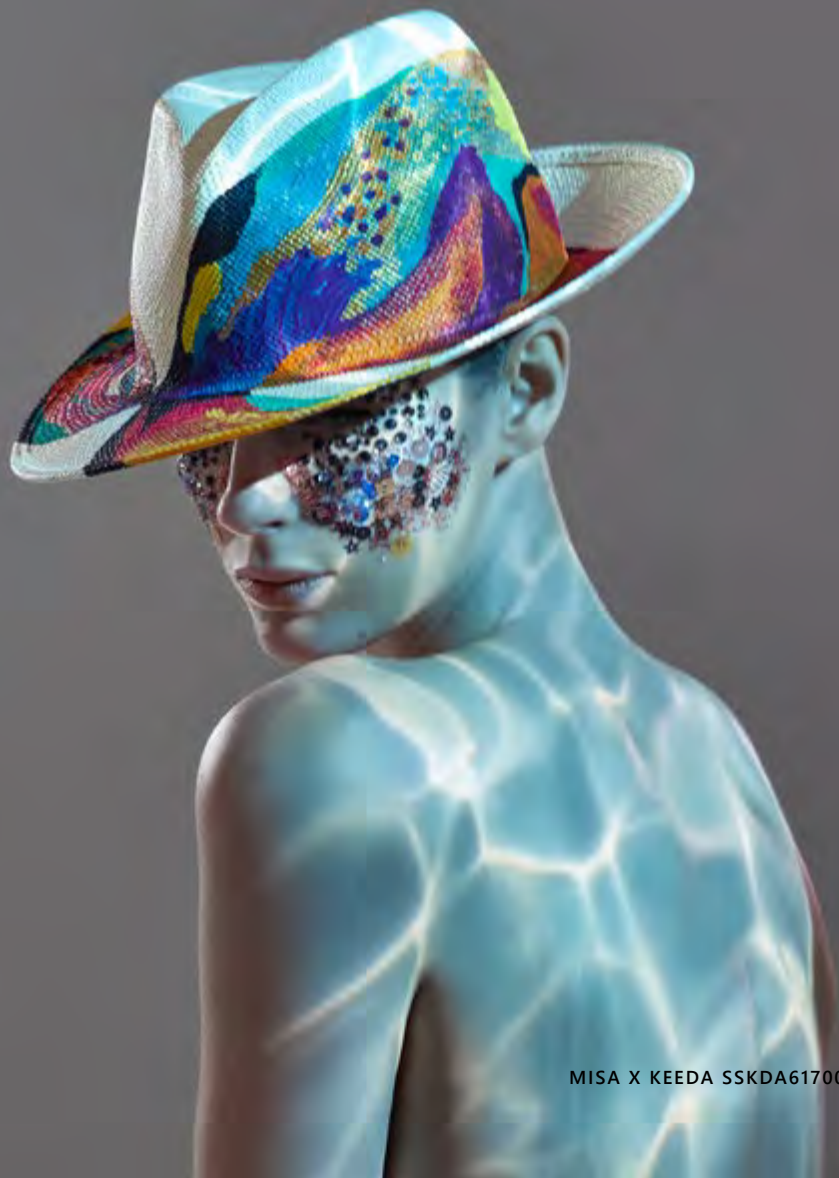
MISA X KEEDA SSKDA617001-A