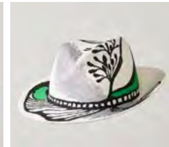
SSKDA617001-C Asymmetric fedora in off white panama hand painted with butterfly motif