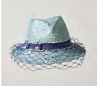
OCEANE SSLUX71733 Asymmetric fedora in sea green ramie straw, wrapped with a frayed denim grosgrain ribbon and honeycomb veil