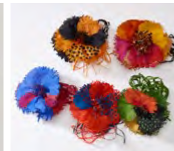
CORSAGE Individually hand painted flowers in raffia