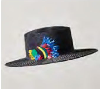
MISTY SSLUX71732 Wide brimmed boater in black wicker sisal, with sequin applique of bird of paradise