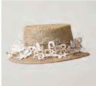
KYLA SSLUX71735 Boater in natural fishnet straw, draped in French lace and veiling